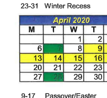
Recess BOE Meeting - 7:00 PM